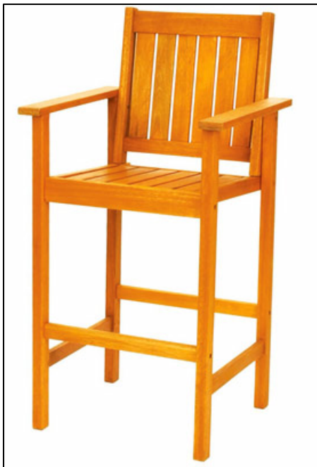
Outdoor Chair: Eucalyptus Bar Stool w/arms

Manufacturer/Source www.restaurant-bar-furniture.com