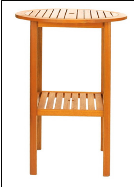
Outdoor table: Eucalyptus Grandis Pub Table

Manufacturer/Source www.restaurant-bar-furniture.com