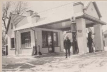
Standard Oil Gas Station, circa 1930

The Village designated 24103 W. Lockport Street, also known as “The Courtyard” a local landmark in May 2009. It was constructed in 1928 as a Standard Oil Station and also operated as Overman’s Certified Texaco Station, Allen Hall’s Texaco, and a Welco Gas Port.