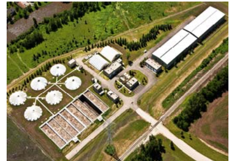
Aerial view of the Wastewater Treatment Plant.