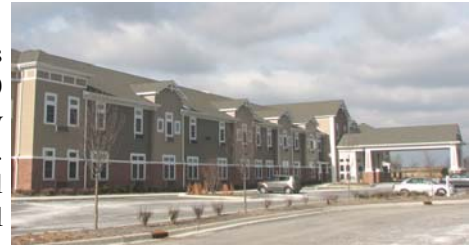
The Park at Plainfield

The Park at Plainfield, a new assisted living and memory care facility on Van Dyke Road, north of the Edward Plainfield Medical campus, is now open for business. The 100,000 square foot facility is a new addition to the Village's long term goal of creating a new medical center for the community at 127 th Street and Van Dyke Road. For more information on the facility, visit www.horizonbay.com .