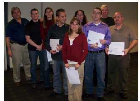
The Presidential Volunteer Service Award was presented to PEMA volunteers who gave 500+ hours of service in 2010.