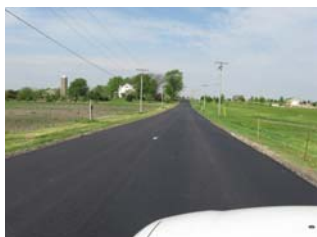
Photos of 127 th Street before & after paving during the Emergency Road Repair Project.

the striping and shoulder restoration will be completed this month.