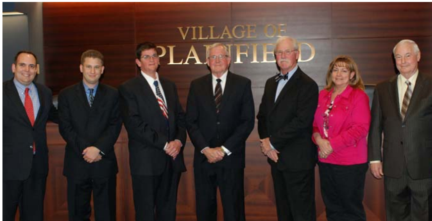
Plainfield Village Board