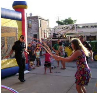
National Night Out Celebration