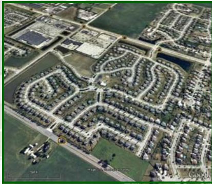
Kensington Club 1.91 units per