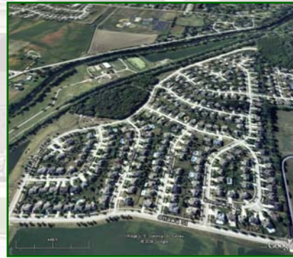
Wallin Woods 1.96 units per