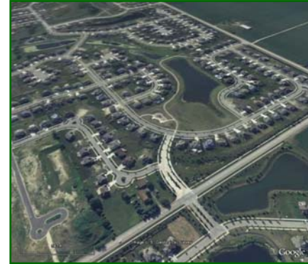
Dunmoor Estates 1.79 units per