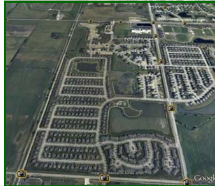
Century Trace 2.56 units per acre