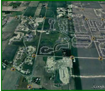
Grande Park 2.3 units per acre