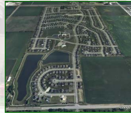
Liberty Grove 2.51 units per acre